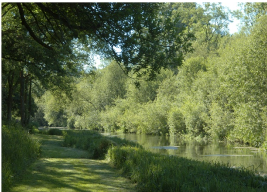
View upstream from start of Beat 2

some walk boards and back to the river. Immediately there is another pool (tricky to cast) and then on up to the pool immediately below the Mill Race. You are now back at the Cabin and the end of the beat.