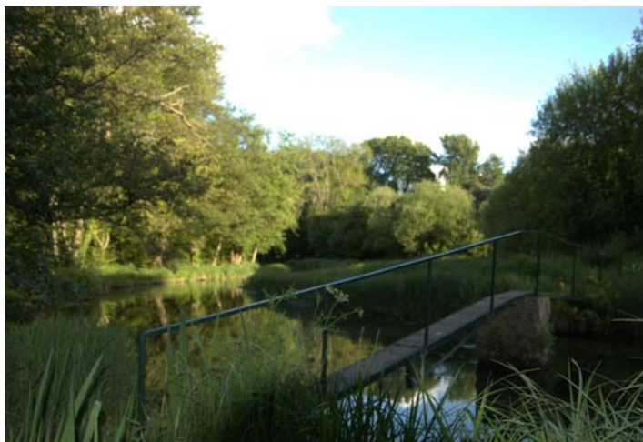
Venice Bridge looking onto Beat 3

The beat ends at the first bridge, which we call Venice Bridge.