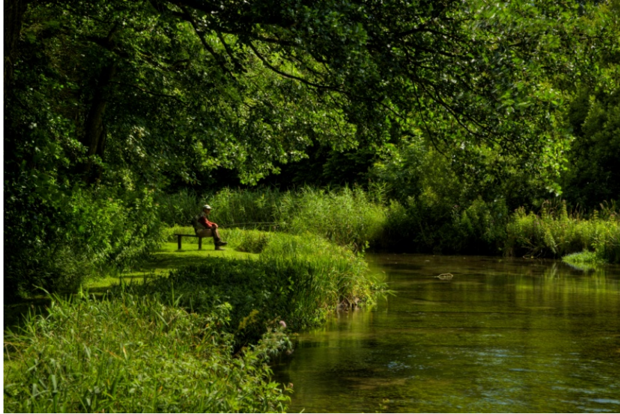
Looking upstream from start of Beat 3

You are in the cabin we call Buckingham Palace, which also has a WC just behind the cabin. We have done a great deal of work on this beat in the past three years and of all the beats this is the one that has the greatest population of juvenile and wild fish.