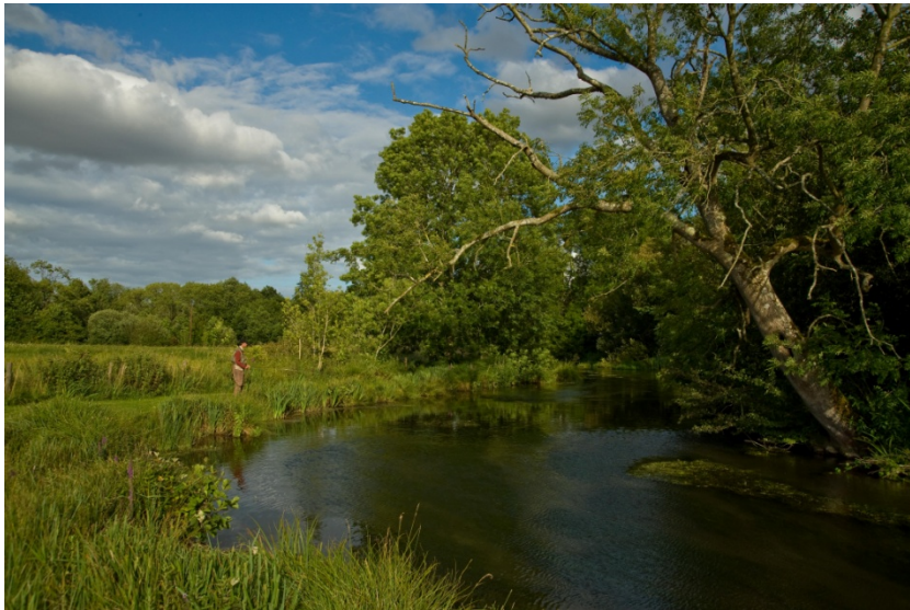
Ash Tree Corner

Looking upstream, all the fishing is on the left bank. Be careful as you cross the bridge; there are fish right under your feet as you cross. Between this bridge and the next bridge is a prime section of shallow water where fish are easy to spot. The first fifty yards or so after the second bridge are nothing much, but once you reach the tussocks go carefully. This bank is very spongy and all the fish lie in the undercut of your bank. We call this grayling alley, which takes you to the excellent Ash Tree corner.