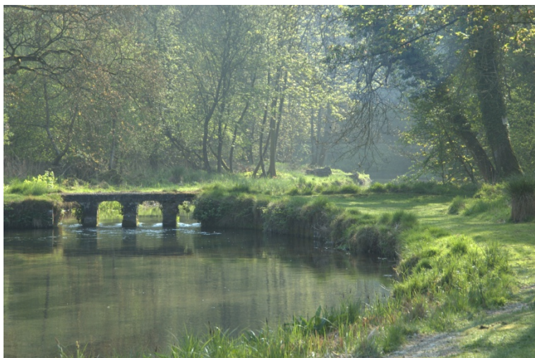
Top hatches. Crossing to left bank and eventually viaduct.

After the first hatches cross to the right bank where casting is tricky until you get past the footpath bridge, where the beat curves right and is fairly open until you reach the second, and top, hatch pool.