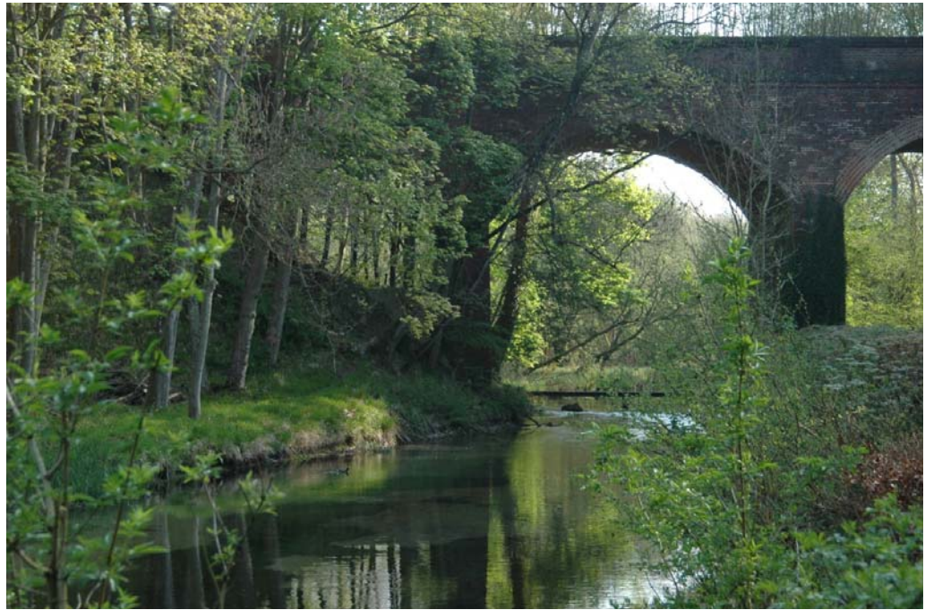
Viaduct. Fish on left and cross bridge to right

On a bright, sunny day fish lie in the deep on the opposite side. If you have waders you can slip into the water at the top, walk under the concrete bridge and fish the final 100 yards or so. We don't manage this in any